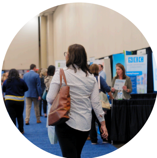
Exhibit Booth Pricing: