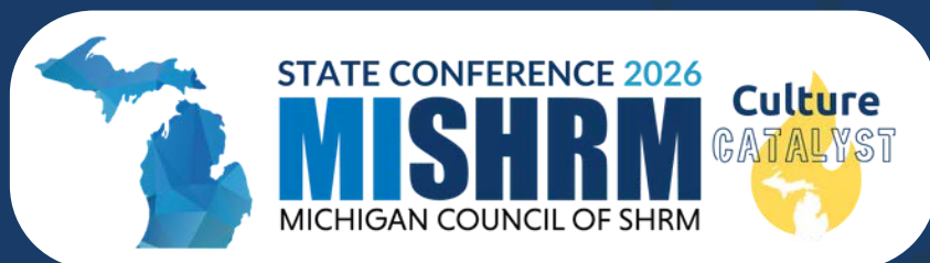
Exhibit space is limited. Claim your spot and showcase your solutions to a highly engaged HR audience.