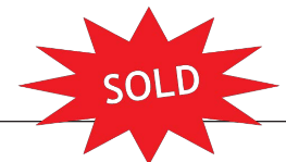
Exhibit Hall Kick Off Reception Sponsor (1 available)